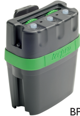
BP525 & BP545

Product Code 27-511 BP511 Single Circuit beltpack (Male and Female XLR-3 Connectors, with loop through)