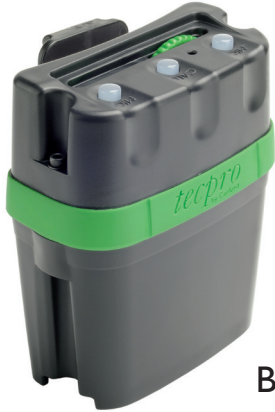
BP511 & BP531