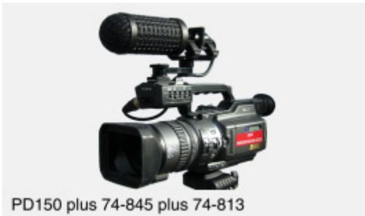
PD150 plus 74-845 plus 74-813