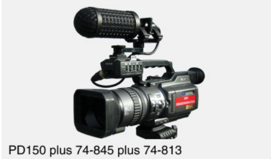
PD150 plus 74-845 plus 74-813