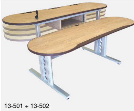
13-501 + 13-502