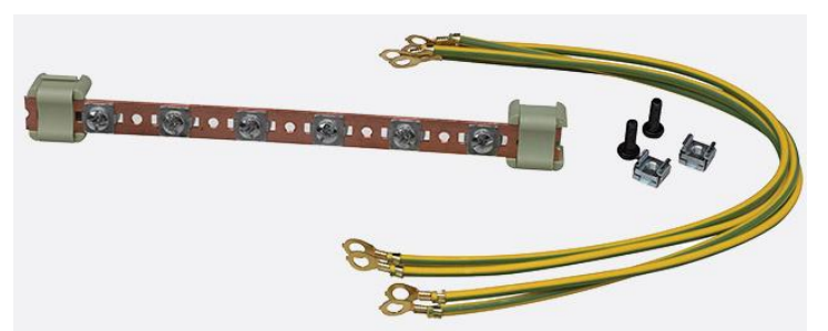
12-7010 CANFORD EARTH KIT 6 earth points, 4 x 4mm diameter 40cm wires

Universal rack earth kits providing a central point for equipment earth connections.