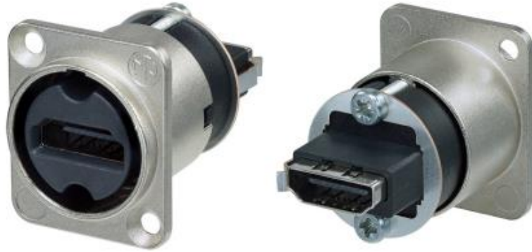
46-583 NEUTRIK HDMI NAHDMI-W Panel mounting, back-to-back feedthrough 46-584 NEUTRIK HDMI NAHDMI-W-B Panel mounting, back-to-back feedthrough

HDMI feedthrough adapter. Universal D housing. Neutrik's HDMI solution for the transmission of any digital TV and PC video format including high-definition video (HDTV) can be integrated in networks very easy.