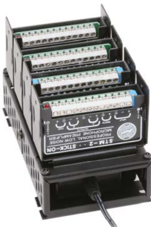
FP-PSB1A Power Supply Bracket with ST-PBR4