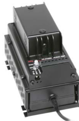
FP-PSB1A with power supply and FP-PA20 audio amplifier mounted