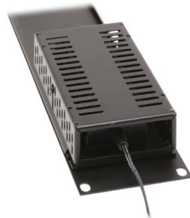
FP-PSB1A mounted in FP-RRR