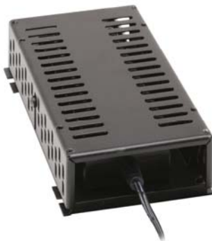
FP-PSB1A Power Supply Bracket with desktop supply

The FP-PSB1A mounts to any flat surface or in an RDL Flat-Pak™ series rack mount panel (FP-RRR or FP-RRRH). The design of the FP-PSB1A allows it to slide into the Flat-Pak rack mount track. Mounting the FP-PA20 power amplifier (or other RDL modules using available adapter) together with the power supply conserves rack space and produces a convenient and professional installation.