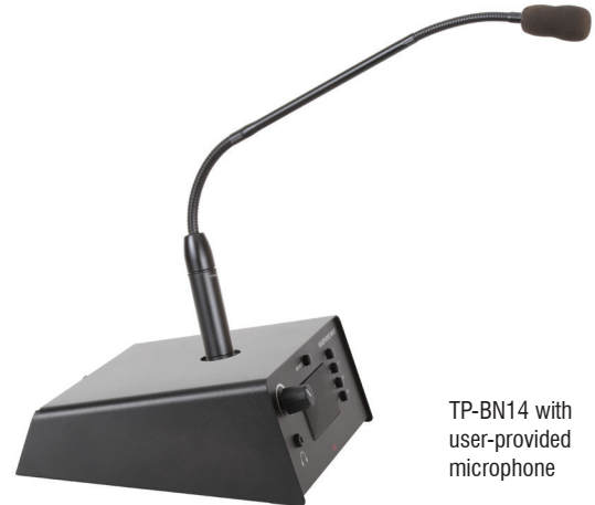
TP-BN14 with user-provided microphone