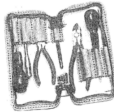
16-381 TOOLMARK TOOL WALLET No.4 Tan This compact leather tool wallet with zip closure and room for nine tools. Closed size 229 x114 x32mm.