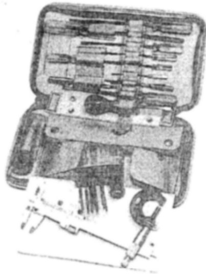
16-383 TOOLMARK TOOL WALLET No.3 Tan With running loops for twelve tools, and a pouch, secured by press-studs, for accessories, this wallet has a zip closure and flat carrying handle. Closed size 317 x178 x45mm.