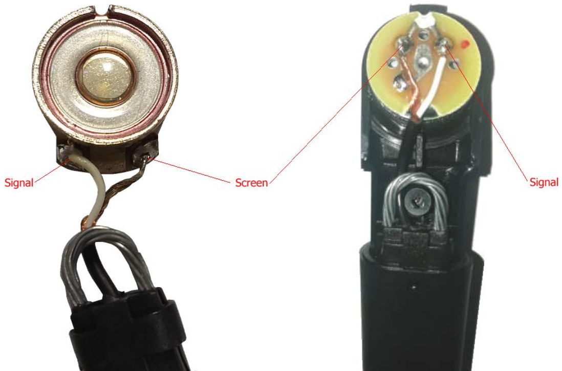
Pre Nov 2021 Capsule contacts on the front

Newer model has the signal and screen contacts on the back of the capsule assembly. Previously contacts were front facing as illustrated below.