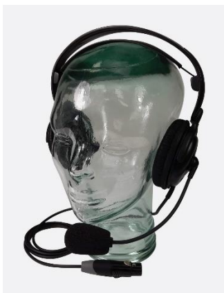
27-135 TECPRO DMH135 Lightweight dual muff headset